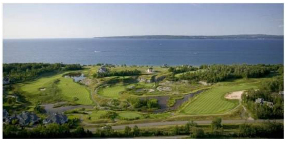
Aerial View of the Quarry Nine at Bay Harbor on Little Traverse Bay

Bay Harbor hosts the opening round on Friday September 24<sup>th</sup> with the championship round following on Saturday @ the Arthur Hills Course at Boyne Highlands. Tee times will be assigned for the Bay Harbor round, and will be announced in the next Yoot Post. Saturdays round will start with a 10am shotgun start for all groups (Saturday starting hole numbers will also be listed in the next Yoot Post). So stayed tuned for Septembers Yoot Post!