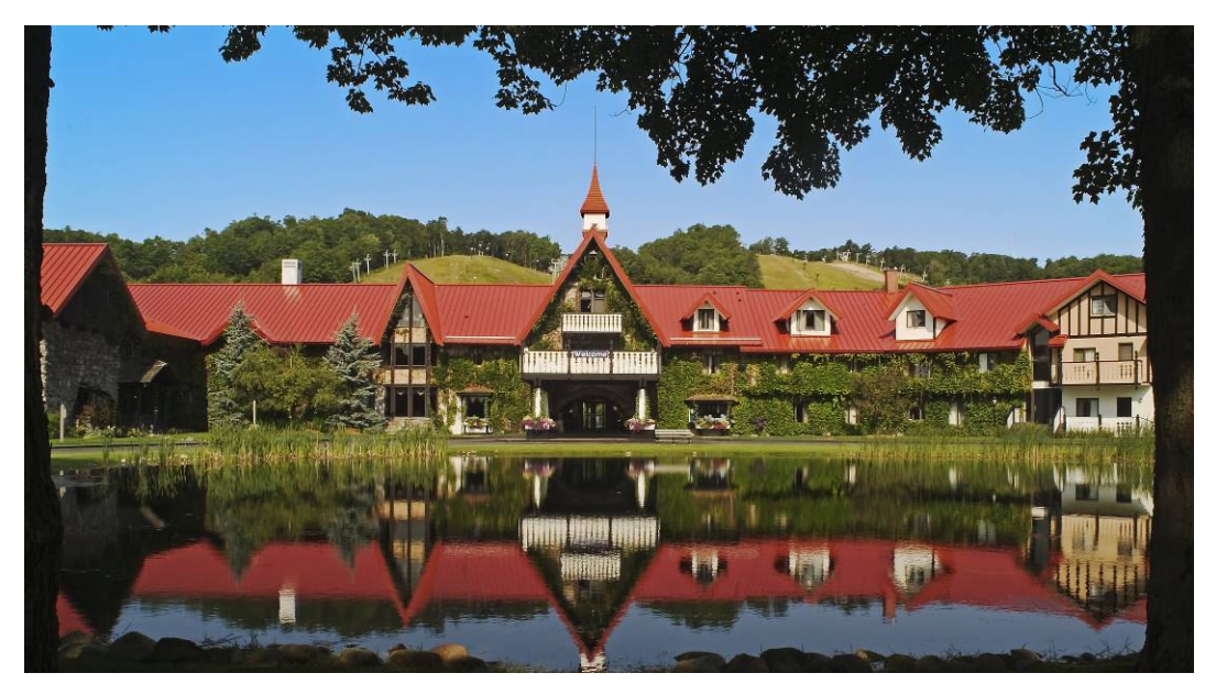
The Lodge at Boyne Highlands - The 2010 Yoot Shoot Headquarters