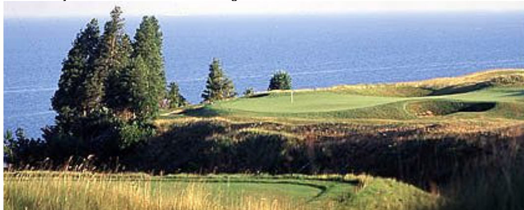
How the hell are you supposed to keep your head down with a view like that!

Your destiny is now clearer...at least for the October 2<sup>nd</sup> weekend! Sixty-four brave souls will tee it up at Arcadia Bluffs & Crystal Mountains - Mountain Ridge course for the 20<sup>th</sup> Anniversary of the Great Northern Michigan Yoot Shoot!