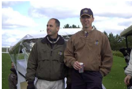
Yoots displaying their goods

Ahhhh...with a little over a month to go until the 2005 Yoot Shoot, the Yoot fashion show hit the runways of New York which marked the release of the 2005 Yoot Wear! Past Yoot champions strutted the famous makers line of beautifully embroidered clothes past wide-eyed patrons leaving them gasping for more. The Yoot wear line has been posted on the Yoot Shoot website along with all information needed to process the order. Go here to see the yootwear ; http://www.yootshoot.com/2005/2005yootwear.htm