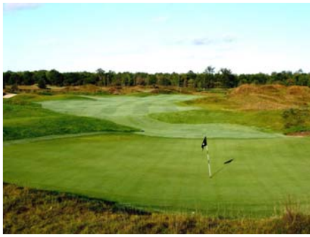
The Gables – looking tame

The Yoot board really did some bargaining this year to get us the best package rate possible! The cost of this year's Yoot Shoot is $220/person staying in the two bedroom suites (quad occupancy). Again, we have included dinner on Saturday evening as part of the package!