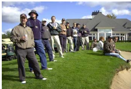
Yoots gather on 18 th in 2002

Therefore, the top 8 teams in contention after Fridays round will tee off from the #1 tee using straight tee times. This will allow all of the golfers to join in the excitement as these teams finish up on #18! Oh the humanity!