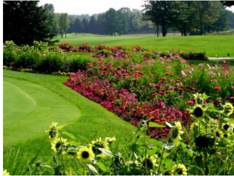
Flowers by the thousands in full bloom

It's late April and as I peer out my window there is frozen white stuff dropping from the sky! What the @^#! As the temperatures hit 84 degrees on Monday they now hover around freezing...As they say "Only in Michigan"! Well, true Yoot Shooters just booked a tee time and are waiting for the "really bad stuff to come"!