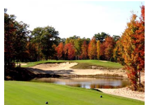
The Blackshire in Autumn

For the final round, it will seem we have moved to the seaside of Scotland where the diabolical Gailes course will be waiting to unleash its teeth on any team in contention! Rated the #1 Best New Resort course in the U.S. in 1993 by Golf Digest, The Gailes with its long fescue heather, double greens & menacing sod-faced pot bunkers will provide as an exciting finish as no other.