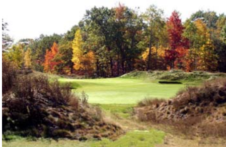
Fall color on The Gables

Single occupancy (hotel style room) will be charged a rate of $295 (Fri/Sat Nt., Golf & Dinner).