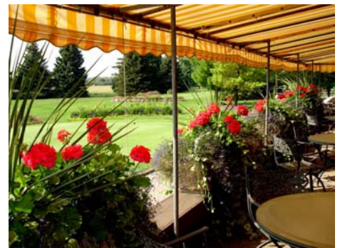
Patio at Lakewood Shores

This year, the non-golfer rate will be $117 for the Friday/Saturday night stay which includes the dinner on Saturday evening. These additional charges will be required up front by the same dates as golfers. Please be aware that the normal Yoot rate is for QUAD occupancy. All efforts will be made to group people up by their teams; however there could be a case where some may have only three people in their room. In that case, those remaining people may be asked to pay the lodging of the missing person.