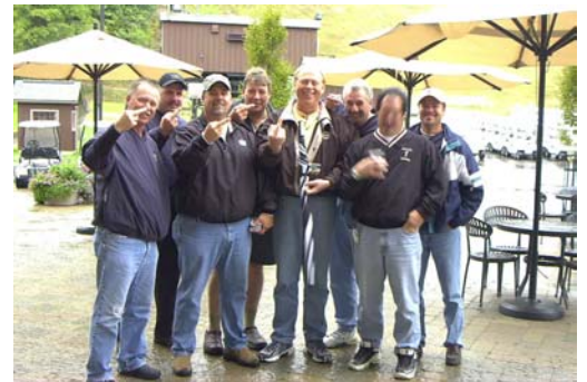
Unruly mob waving "Hi" to camera

Tee times for the pre-round on Thursday are listed on an attached sheet. (See pages below) Please make sure you check-in to the pro-shop at least 15 minutes before your designated tee time. These tee times have been reserved, so if you do not show up, you will lose your "Free round certificate".