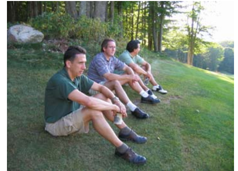
Yoots gather on the Smith #18

For Thursday & Friday rounds, we will assemble at the "Treetops North" Pro Shop located a short drive (about 5 miles north) up Wilkerson Road from the lodging where you check in. This is where both the Fazio (Thursday) and Smith Signature (Friday) courses are located. The Jones Masterpiece, which we play on Saturday, is located very close to the main lodge at the Treetops main facility (where you check in at). Carts will be assembled with your team names on them, along with your starting hole number. (starting hole number will be the same both days)