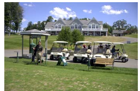
Treetops "North" Clubhouse

For Thursday & Friday rounds, we will assemble at the "Treetops North" Pro Shop located a short drive (about 5 miles north) up Wilkerson Road from the lodging where you check in. This is where both the Fazio (Thursday) and Smith Signature (Friday) courses are located. The Jones Masterpiece, which we play on Saturday, is located very close to the main lodge at the Treetops main facility (where you check in at). Carts will be assembled with your team names on them, along with your starting hole number. (starting hole number will be the same both days)