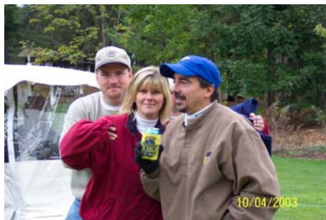
Yoots discuss driving strategies

A BIG thanks to 3-Dimensional Services for this generous donation!