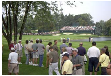
Crowds gathering for the 2003 Yoot

The crowds swell, as a quiet hush falls over the gallery. A bead of sweat forms on your brow as you lean over your ball for a putt to win the 2004 YOOT SHOOT! You slowly pull back your putter and as precise as a grandfather clock pendulum, you strike the ball towards the hole. In the distance you see the ball curving on a perfect arc, slowly rolling right at the heart of the cup. The crowd noise increases in volume as each revolution of the ball gets closer to the cup...at only inches away, the crowd has reached a feverish pitch....suddenly you awake, sitting straight up in a hot sweat, tangled amongst your damp blankets screaming "GO IN BITCH"! Startled, with your heart pounding in your chest you realize it's 3am and you have to get up for work in 3 hours. Sometimes life just throws you a curve now and then. But not to worry, it all may come true in just a few more days! Start packing your bags...The 2004 Yoot Shoot is finally here!