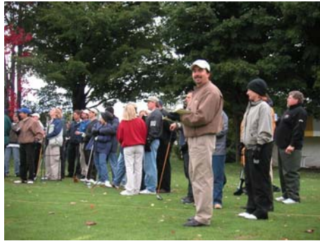
Gathering for a long drive

Through a generous donation, we will be holding a " Team Long Drive Contest " on Friday following our round! This is the second year for this event and I can tell you first hand that the winners receive FIRST CLASS PRIZES , so don't MISS OUT! (Check out my new Tour Style Golf Bag!) A combined yardage of all four team members is used to calculate the winning team. Only the balls landing in the designated fairway will be counted, so keep it straight and long! (only DRIVERS may be used) Each team has been designated a "Driving time" and is listed in an attachment included in your Yoot Goodie Bag. Please have your team warmed up and ready to go at the time listed for your team. If inclement weather strikes, this event will move to Saturday.