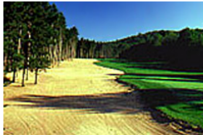
Mountain Ridge #15

For those that have not paid their full payment in advance, the final payment is due by August 29 th . This amount will vary depending upon if you golfed in the Yoot Shoot in 2002 (and have a rain out refund due). If you played in 2002 and paid a $100 deposit, the final payment is $101. If you DID NOT play in 2002 and paid a $100 deposit, your final payment is $136. You can pay by check or online using a credit card at the Yoot Website. Make checks payable to "Yoot Shoot" and send to the address in the lower left corner. Please allow 5 days for delivery.