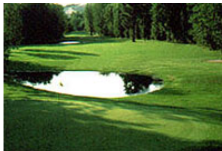
Betsie Valley hole #4

For those that have not paid their full payment in advance, the final payment is due by August 29 th . This amount will vary depending upon if you golfed in the Yoot Shoot in 2002 (and have a rain out refund due). If you played in 2002 and paid a $100 deposit, the final payment is $101. If you DID NOT play in 2002 and paid a $100 deposit, your final payment is $136. You can pay by check or online using a credit card at the Yoot Website. Make checks payable to "Yoot Shoot" and send to the address in the lower left corner. Please allow 5 days for delivery.