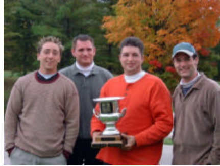
Will the 2000 victors pay first?

Would you bet that this scary bunch would be the first to submit their final payment? Hmmmmm, I highly doubt it! But don't let that stop the rest of you from making that final payment on time! The final payment of $130 is due at my mailbox by Friday Sept. 7 th , 2001. DO NOT be late or you will lose your deposit! We DO have a waiting list for people ready to step in, so make sure you mail it 5 days in advance.